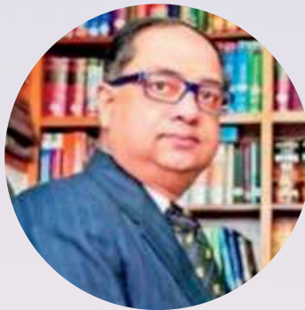
Shri Mohan Parasaran (Member) Former Solicitor General of India NEW DELHI